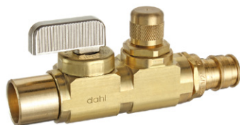
BALANCING VALVE 121BAL-13-PRPX3 1/2 Female Solder x 1/2 F1960, Straight, Brass Balancing Valve