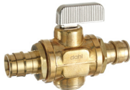
IN-LINE VALVE 121LB-PRPX3-PRPX3 1/2 F1960 x 1/2 F1960, Straight, Brass, Large Bore