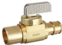
ISOLATION VALVE 121-13-PRPX3 1/2 Female Solder x 1/2 F1960, Straight, Brass