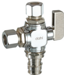
DUAL OUTLET VALVE 111-PRPX3-31-31 1/2 F1960 x 3/8 OD Comp x 3/8 OD Comp Straight Dual Outlet, Plated