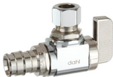
SUPPLY STOP 211-PRPX3-31 1/2 F1960 x 3/8 OD Comp, Angle, Plated