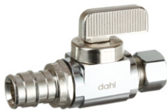
SUPPLY STOP 111-PRPX3-31 1/2 F1960 x 3/8 OD Comp, Straight, Plated