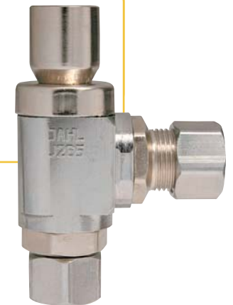
216-41-31 shown 3/8 OD Fem. Comp x 3/8 OD Comp