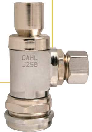
216-46-31 shown 1/2 CPVC x 3/8 OD Comp