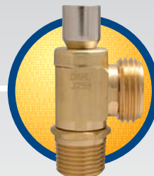
226-01-04 1/2 Dual (C or M) x Hose