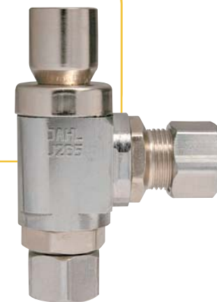
216-41-31 shown 3/8 OD Fem. Comp x 3/8 OD Comp