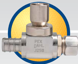
116-PX3-31 1/2 Crimpex x 3/8 OD Comp