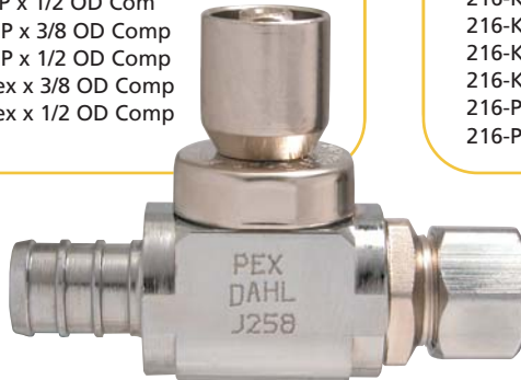
116-PX3-31 shown 1/2 Crimpex x 3/8 OD Comp