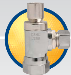
216-52-31 3/8 FIP x 3/8 OD Comp