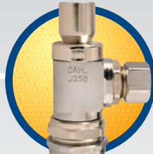
216-46-31 1/2 CPVC x 3/8 OD Comp