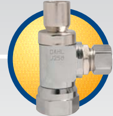
216-52-31 3/8 FIP x 3/8 OD Comp