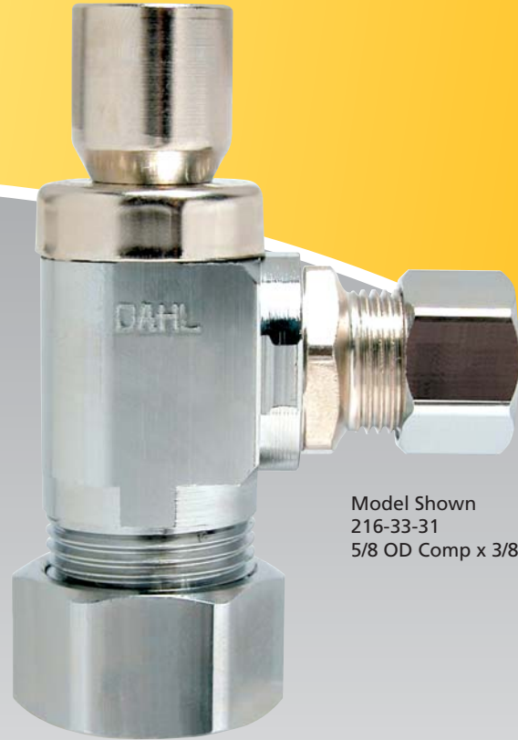
Model Shown 216-33-31 5/8 OD Comp x 3/8 OD Comp

including supply stops, hose valves, in-line stops, petcocks, balancing valves and more!!