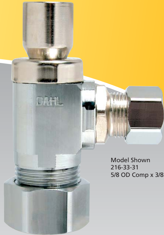
Model Shown 216-33-31 5/8 OD Comp x 3/8 OD Comp

including supply stops, hose valves, in-line stops, petcocks, balancing valves and more!!