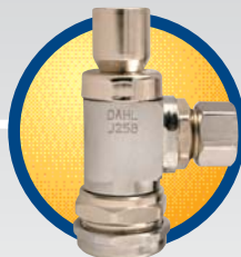
216-46-31 1/2 CPVC x 3/8 OD Comp