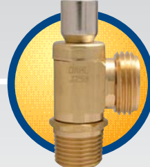
226-01-04 1/2 Dual (C or M) x Hose