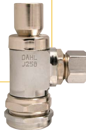
216-46-31 shown 1/2 CPVC x 3/8 OD Comp